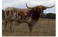
Sharp Shooter 542