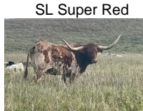
SL Super Red