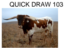
QUICK DRAW 103