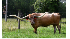
HORSESHOE J EXAMPLE