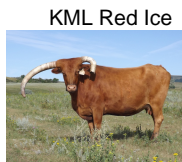
KML Red Ice