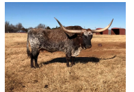
HUNTS COMMAND RESPECT