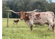
HORSESHOE J CADENCE