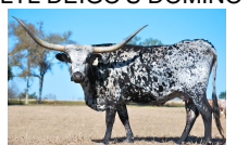
LTL DEIGO'S DOMINO