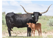
BLACK ICE YS