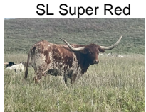
SL Super Red