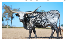
LTL DEIGO'S DOMINO