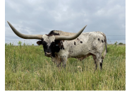
BL RIO CATCHIT