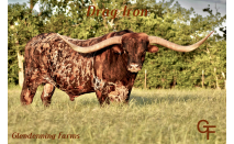
Field Of Pearls