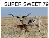
SUPER SWEET 79