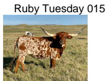
Ruby Tuesday 015