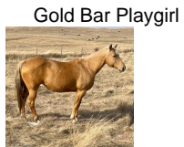
Gold Bar Playgirl