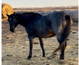
Blu Summer Hancock