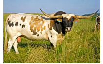
BOWL OF ROSES