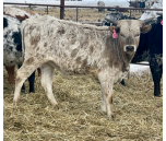
Leather and Lace 220